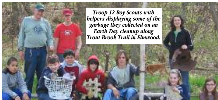
Troop 12 Boy Scouts with helpers displaying some of the garbage they collected on an Earth Day cleanup along Trout Brook Trail in Elmwood.

In addition to the work, everyone was treated to a number of floral specimens