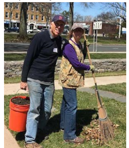
Clean up day 2018.

Bring your own lawn rakes, gloves, and tarps, and anything else you think will come in handy! Interested persons may contact Mark Swanson with questions or scheduling at 860-936-8255.